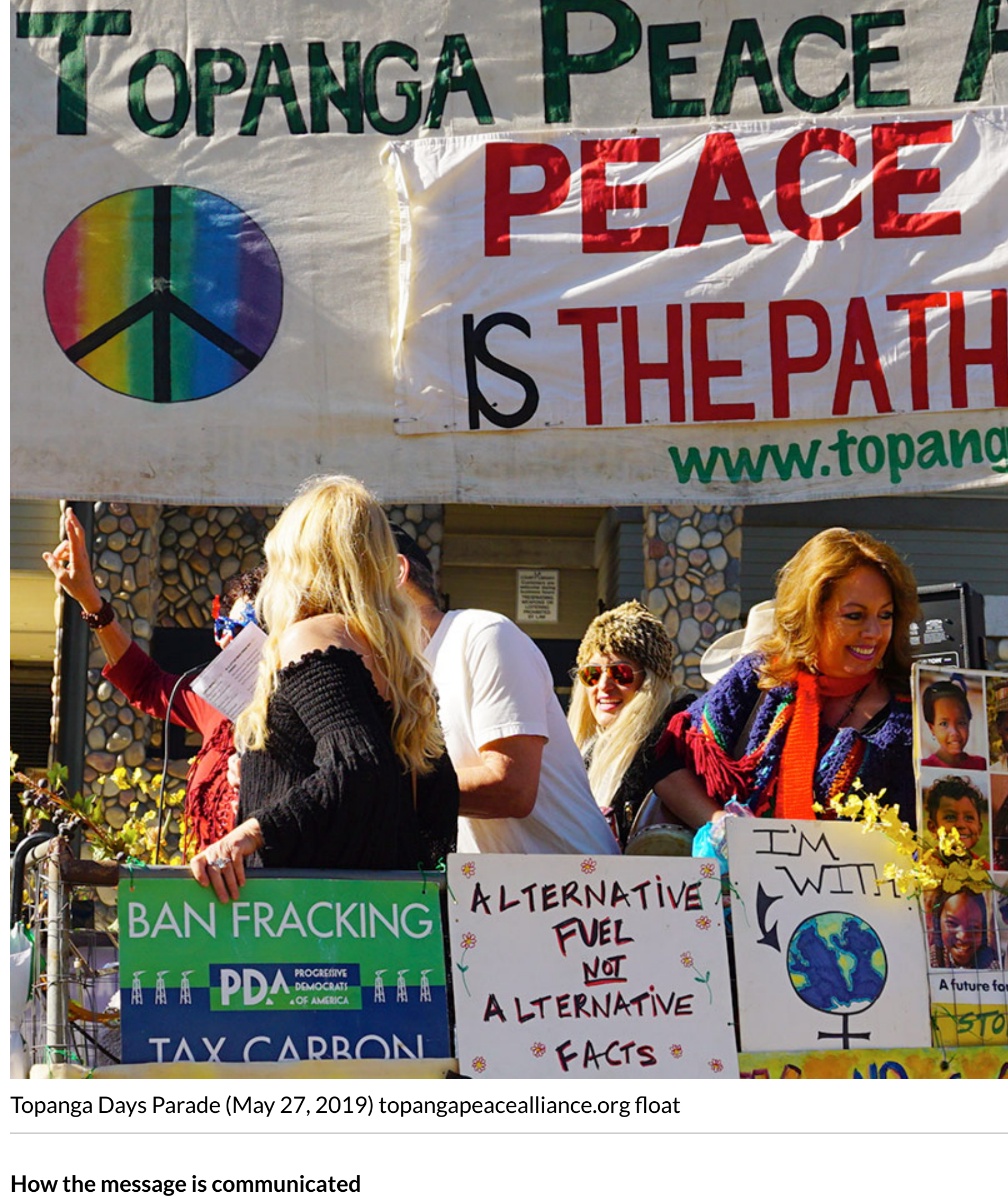
The approaches vary in how people voice their concerns about environmental issues in parades and marches. Some participants employ:

entertaining theatrics when retelling some historical incident